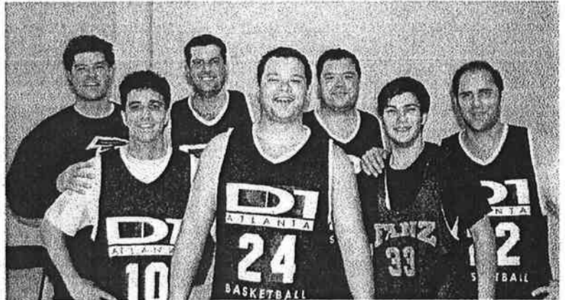
Members of the Atlanta Chapter #1 basketball team celebrate a first place win in the mid-winter tournament

We look forward to more great competition at the invitational tournament (open to all Districts) hosted by District 1 in Atlanta, GA as part of the Labor Day Weekend festivities.